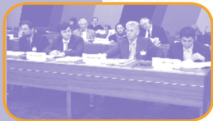
Participation of Mayors from Kosovo at the meeting.

The different activities are transborder co-operation, youth programmes, strengthening local authorities and civil society, economic development and minorities. Those activities are proposed for the LDA next year.