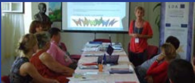
Thematic Round Table: Intercultural local governance and co-operation programme perspectives

The School of Local Democracy has been a five day residential training seminar for local government officials and civil society organisations held by intercultural governance workshops. The participants come from partner organisations of LDA Subotica, local authorities included in ALDA network