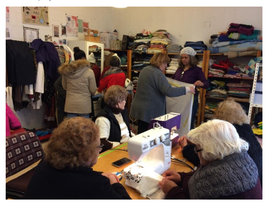
Building a Diversity Blanket, Lisbon, Portugal, 20th – 26th February

The results of the pilot projects are the following; the activities successfully provided an interaction between the different target groups as well as the integration of people from different cultures within the diverse community of the area. This in turn helped establish a relationship between the citizens from different cultures and nationalities and promoted a space for an intercultural dialogue. Moreover, the sports activities were used as a tool for the promotion of integration through non-verbal communication which provided inclusion for those who did not speak sufficient Portuguese. The projects overall also created a network of partners who share the same concerns in order to further produce collaborative projects.