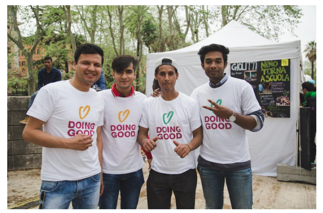
Good Deeds Day 2018, Rome, Italy, 15<sup>th</sup> April 2018

The intercultural laboratories targeted a group of 240 children from kindergarten and primary school classes, as well as their teachers and family members. The laboratories offered activities such as; theatre and African dance workshops, children's choir of Piazza Vittorio, innovative art workshops on the English-Chinese language and a one-day public event called Good Deeds Day 2018