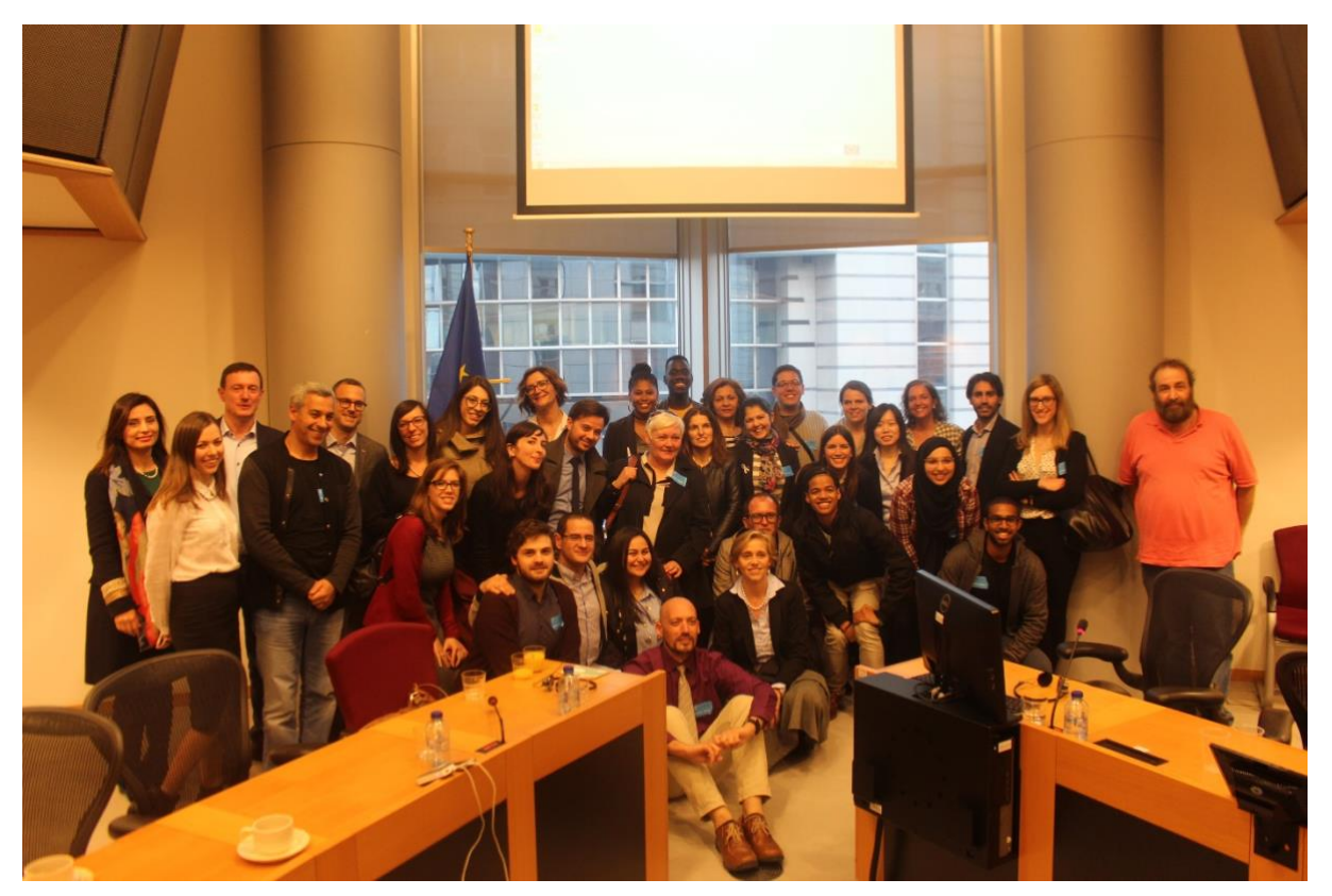
Seminar "Employment, Culture, Participation: re-shape European cities and communities for the effective inclusion of migrants", Brussels, Belgium, 22<sup>nd</sup> March 2017