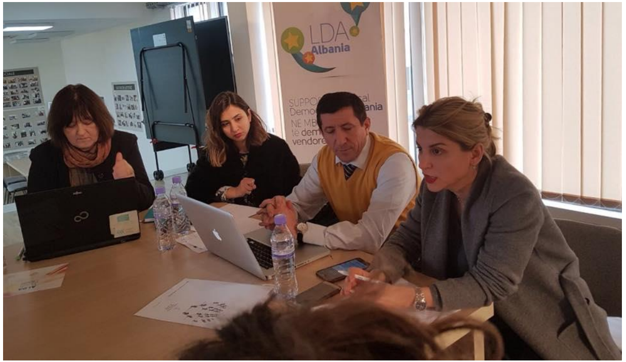
Seminar: Local Stakeholders Involvement in Migrants' Inclusion, Vlora, Albania, 9th March 2018