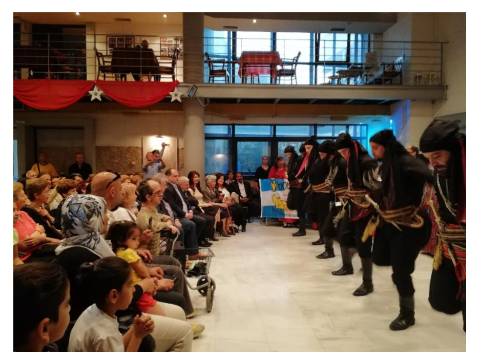
Town Against Discrimination Event, Aghia Varvara, Greece, 6 May 2018