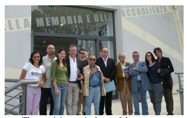
The participants in front of the museum

The event took place in the Municipality of Nardò on 24 September 2010. Delegations from different parts of Puglia and several international guests visited the Welcome Memorial Museum (Museo della Memoria e dell'Accoglienza) in Nardò, Santa Maria al Bagno, Lungomare Lamarmora.