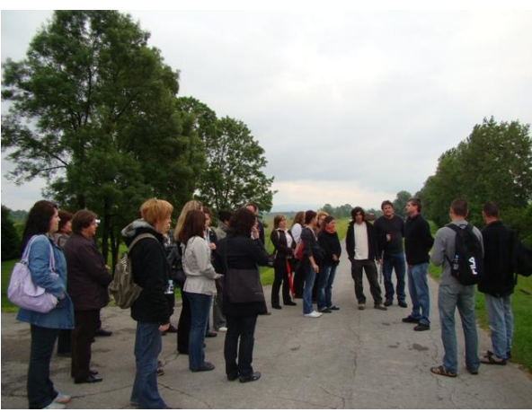
Participants during the guided tour of Jasenovac