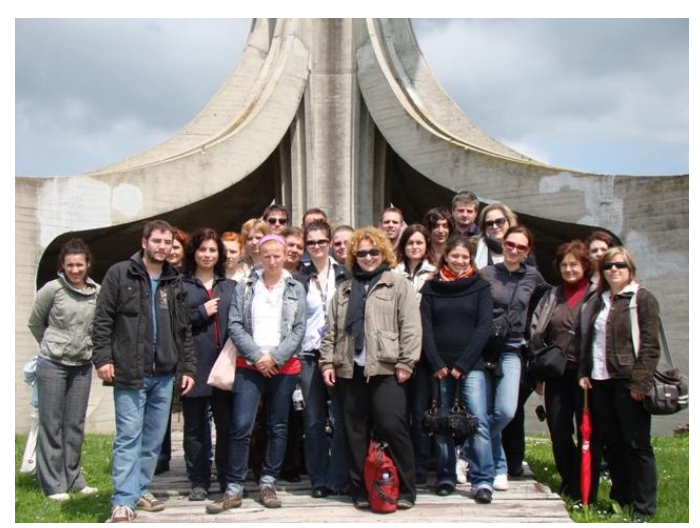
Participants of the event in front of the Flower Memorial in Jasenovac

<u>Local activity in Sisak/Jasenovac (Croatia)</u> May 22<sup>nd</sup>, 2010