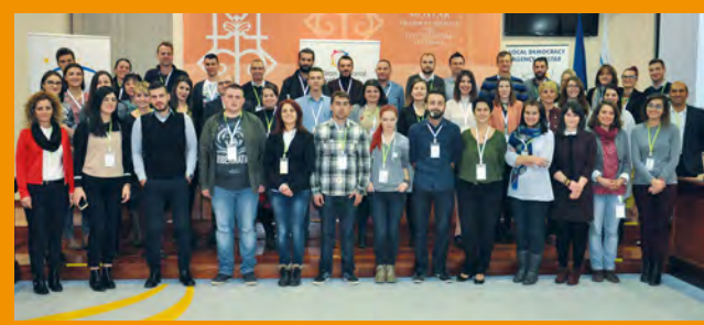
Regional Forum organised in Mostar, Bosnia and Herzegovina | November 2016