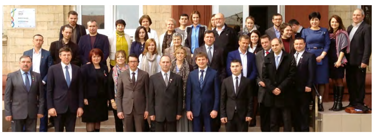
Group picture at the opening of the LDA Moldova in Cimişlia | March 2017

The support to communities' initiatives, the cultural heritage, the public administration reform, the system of local self-government and civic participation: these are the topics addressed by ALDA in six countries of the Eastern Partnership. Furthermore, as the leader of the sub-group on public administration reform and local self-governance of the Civil Society Forum of EaP, together with partners from six countries, ALDA has published a document assessing the current situation on PAR and decentralisation in the region. The document carries the comparative element and proposes recommendations and solutions per country. The report was prepared in the frame of the project "Update on Public Administration and Local Governments Reform in EaP" funded under the sub granting scheme of CSF EaP. This paper will be used as a baseline to start a wider discussion on the subject in all six countries of the EaP in the next future.