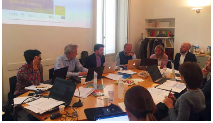
Kick-off Meeting of the project ENLARGE in Milan, Italy | October 2016