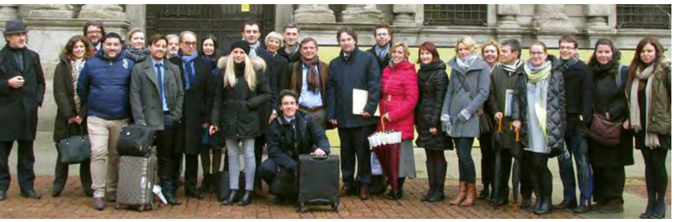
International activity of MEANING in Milan, Italy | February 2017

The project aims at building a thematic network of European Metropolitan Cities that exchange knowledge, experience and good practice on their management and role in the future of European governance, by focusing on the participation of citizens in these processes. The network gathers Metropolitan Cities with years of experiences with the Metropolis institutions and realities.