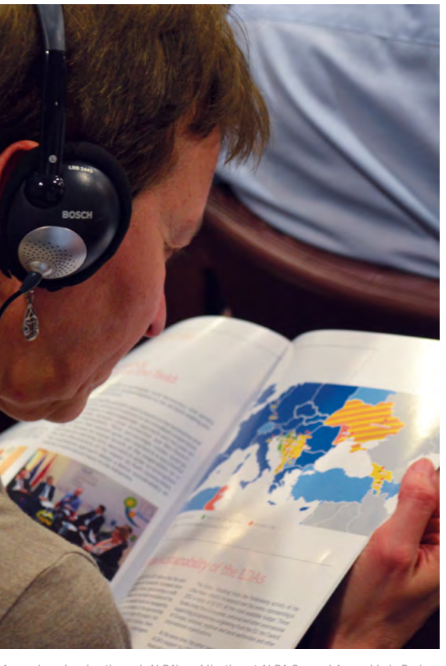
A member glancing through ALDA's publication at ALDA General Assembly in Paris, France | May 2016

The network of ALDA grows year by year, thus reflecting the added value of the membership (the online and offline activities of the working groups open to all members are one of the most visible outputs), as well as the fruitful cooperation among members representing local and regional authorities, and civil society in the EU and its Neighbourhood. Up to today, ALDA counts more than 250 members.