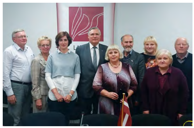
Study visit to Lithuania | August 2016

SPREAD II is the continuation of the previous SPREAD project, run with our long-standing Belarus-based partner: Lev Sapieha Foundation. The main objective of this project is to contribute to an inclusive and empowered civil society in Belarus, by strengthening their capacities to promote local self-governance and increase public accountability while facilitating the cooperation between local authorities and communities, and improving citizens' access to public services and better living conditions. The project reaches these objectives through several calls for applications under its re-granting scheme: in total, ALDA had supported 19 mini projects in the frame of the project SPREAD II. In April 2016, within the two-day event organised in Brussels in the premises of the European Parliament and EED, an important discussion was held on the state of the dialogue between citizens and institutions in Belarus. The discussion saw the participation of interested MEPs, EU Institutions representatives, NGOs, think-tanks, embassies, and the wider public.