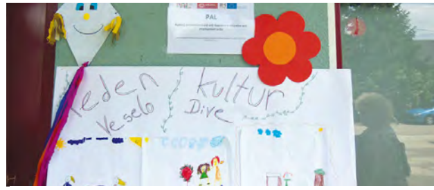
Participation of PAL project in the Week of Cultures in Novo Mesto, Slovenia | June 2016

This two-year project aims at developing a comprehensive approach and endorses a number of goals in education and employment, in order to speed up Roma Integration, support the implementation of national Roma inclusion strategies and the Council Recommendation of Roma Integration. The project provides support to Roma youth participation on different levels, by gathering qualitative data about approaches and practices of Roma youth and supporting initiatives where Roma participation is key to long-term change. Activities aim to enhance multi-stakeholder cooperation, promoting common democratic values, strengthening fundamental rights and consolidating the rule of law: these are horizontal