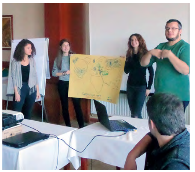
First workshop within the project organised in Bitola, Macedonia | November 2016

This project aims to contribute to conflict prevention through the organisation of public awareness activities with high schools around the geopolitical reasoning behind the First World War, the British contribution to the First World War battles in the Republic of Macedonia, and the lessons learnt from this conflict. In November 2016, the first workshop was organised. Through the sessions, the participants had the opportunity to strengthen their knowledge about World War I (the fronts, the situation in Bitola through a field trip), as well as to enhance the role of young people in their societies in relation of the process of reconciliation.