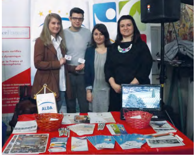
of Franchophonie in Skopje, Macedonia | March 2016

The project "Volunteers for European Remembrance" consisted of hosting 2 EVS volunteers from France for a period of 12 months in ALDA's office in Skopje, Macedonia. The volunteers worked on activities focused on the promotion of peace and European citizenship, such as promoting EU citizenship and exchanges to youngsters, CSOs and local authorities in Macedonia and leading youth projects and workshops on the topic using new technologies and communication tools.