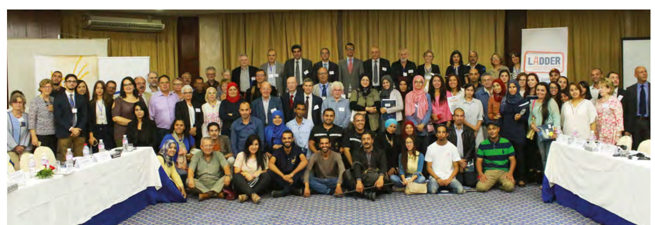
MED Special initiative in Tunis, Tunisia | October 2016