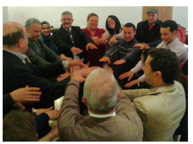
Training for Tunisian municipalities staff in Kairouan, Tunisia | February 2016

The project aimed at improving communication skills of civil servants of Tunisian municipalities. Around 50 participants took part in the two-days trainings, held in Tunis and Kairouan. In particular, ALDA brought its experience on the relation between communication and citizens participation, highlighting opportunities for mobilising citizens in cooperation with civil society and media.