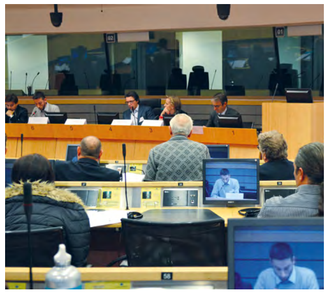
International Activity WE-NET in Brussels, Belgium | November 2016

The objective of the project WE-NET is to establish a thematic network of local authorities and civil society organisations from different regions across Europe to work together on the promotion of circular economy at the local level, by facilitating the exchange of knowledge, experience and good practices.