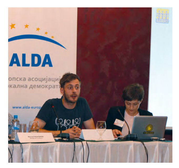
International seminar on "Cooperation on the governance of migration in Western Balkans and Central European countries" organised in Skopje, Macedonia | June 2016

This project, focusing on migration management, aimed at sharing best practices and exchanging know-how with multipliers in the area of migration management, with a special emphasis on towns and villages in the Western Balkans and in Central Europe. In June 2016 an International Seminar on "Cooperation on the governance of migration in Western Balkans and Central European countries" was organised, gathering participants from 11 countries. The result of the seminar was the creation of a regional Balkan network on the migration crisis, exchange of good practices at a local level on the Balkans and some EU-countries.