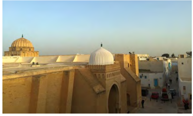
Panorama on the Great Mosque of Kairouan, Tunisia

This project, co-implemented by the cities of Strasbourg and Kairouan, and launched in October 2016, proposes the setting up and the sharing of technical and methodological tools allowing the development of a global and coherent vision of mobility in the city. In fact, the citizens of Kairouan are key in the successful development and implementation of the project, which counts on the involvement and participation of the city's population. The municipalities of Strasbourg and Kairouan will rely on the competences of ALDA given its experience of several years in the country and more particularly in Kairouan, where the opening of the upcoming Local Democracy Agency is foreseen, and whose activities will be