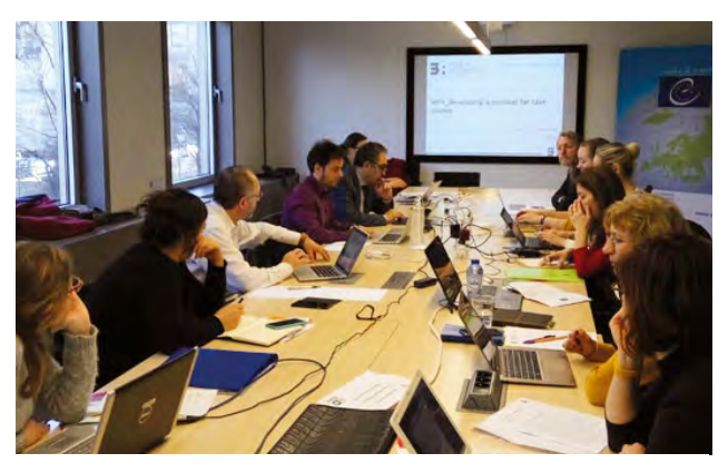
RE.CRI.RE General Assembly in Brussels, Belgium | February 2016

The three-year project aims at analysing cultures of European societies and the impacts of the socio-economic crisis on them, in order to frame better policies at local, national and European level. To this end, civil society, policy-makers and experts of social sciences cooperate via a multi-stakeholder approach in RE.CRI.RE. actions.