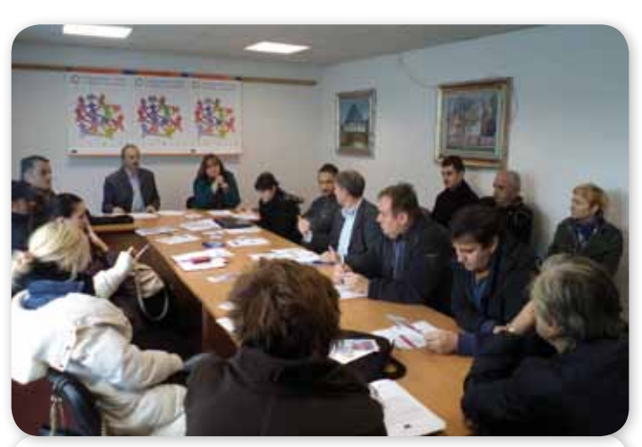
Meeting programme IPA BiH

thematic workshops, trainings, local campaigning for effective implementation of MoU in six municipalities gave an insight into the present challenges of implementing EU standards of democratic governance at local level, the role of local self-governments in EU integration process as well as an overview of local practice in implementing municipal co-operation agreements in Bosnia and Herzegovina. Issue based networking of CSO-s engaged in local democracy development, youth and women's empowerment and environment protection resulted in creation of the informal regional network promoting good governance and active citizenship in Bosnia and Herzegovina. Further to this, information campaigns were organized in support to better co-operation between local authorities and CSO-s, local CSO address books were printed and disseminated while the Handbook on best practices promoting crosssectoral partnerships will be published and widely disseminated.