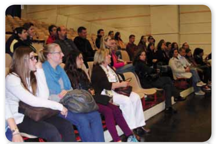
THINK EU, visit in Vicenza

blic understanding at grass root level for the EU enlargement process, its current situation and challenges in our region, more specifically in the five EU MS: Hungary, Slovakia, Austria, Romania, Italy. The Local Democracy Agencies in Western Balkan countries were included in the project activities through: exchange of information on EU integration progress, internship programme for young people organised and hosted by EU partner organisations, design and production of promotion materials to be disseminated during the PRINCE tour and EU labyrinth organised in September in Budapest, Bratislava, Wienna, Graz and Udine. Communication tools produced included interactive website, social networks, questionnaire on EU integration, country profile info sheets for the citizens in local communities visited during the Labyrinth tour.