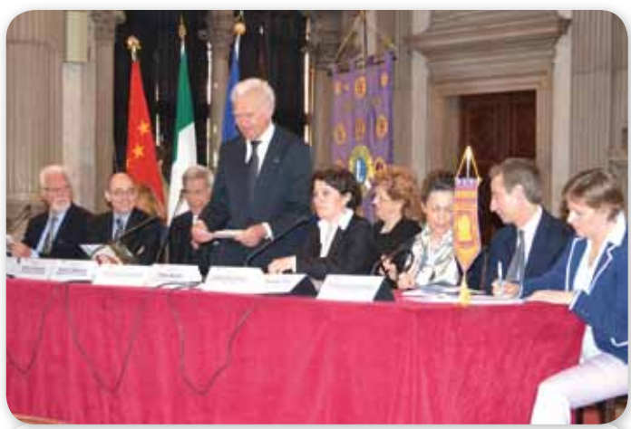
LIONS Club, Venice, 28 April 2012

ALDA cooperated with the Lions International Venezia Host for the organization of an international conference, held in Venice on the 28th of April, focused on good governance and active citizenship. Different institutions and organizations (Council of Europe, local authorities, NGOs, etc.) took active part in the event and the debate, as well as in the related event inaugurating the first "active citizenship park" in Venice.