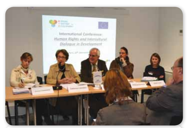
WTD, International Workshop, Human Rights, Paris December 2012

lopment agents in and outside Europe, in partnership with European and national institutions.