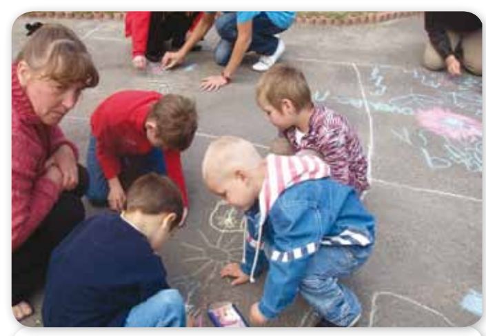
Activities in Belarus

ALDA has been active in Belarus since 2004 and has implemented several projects together with its main partner in Belarus the Lev Sapieha Foundation. The TANDEM project is a follow up to former projects (ACSOBE and REACT) which focused on the strengthening of civil society organisations and local community groups and their cooperation with local authorities. As citizen participation at the local level is still limited in Belarus, TANDEM main objectives were foreseen as undoubtedly significant, providing both technical and