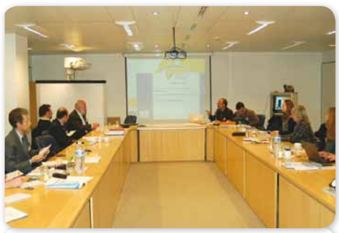
WTD, Steering committee, Brussels

Working Together for Development (WTD) - Non-state actors and local authorities in development – European Commission