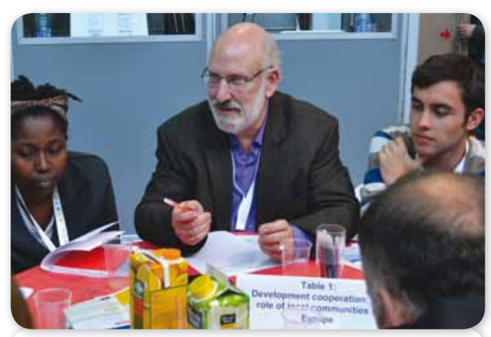
WTD, European Development Days, Brussels October 2012

nised to exchange experience and provide the participants with further expertise on these issues.