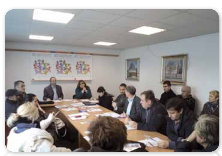
LDA MOSTAR, IPA BiH, Bihac radne grupe