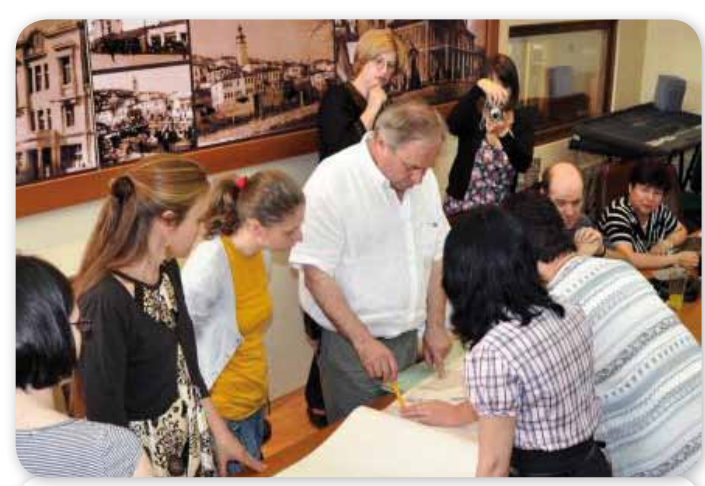
Activities in Macedonia

The local government is facing a numerous issues: