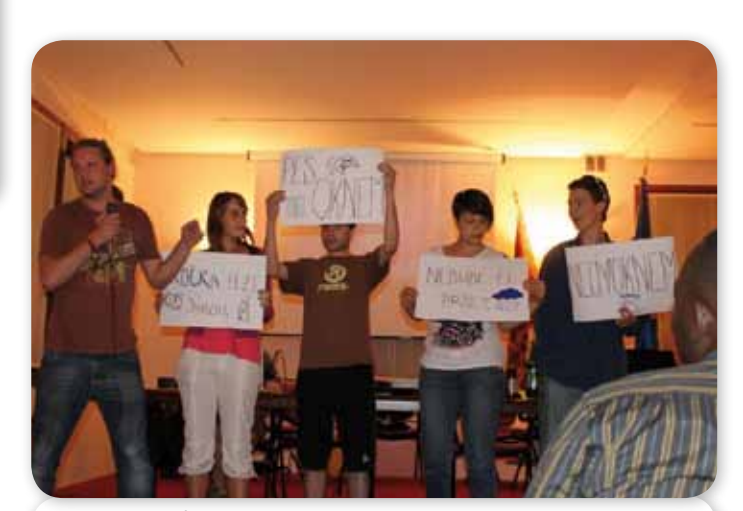
Activities of the project

The project will involve about 400 young people in the 6 countries and will allow them to become aware of the global situation of employment in Europe, stimulating them to imagine new styles and visions for youth entrepreneurship.