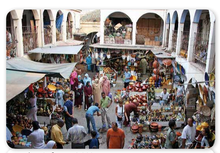
Market, Safi, MAROCCO

The launching conference in April gathered around 60 young people, representatives of youth organisations and local authorities, researchers, experts coming from 14 Euro-Mediterranean countries. Eighteen months after the first events of the "Arab Spring", this conference allowed an open space for discussions and exchange of good practices between people from different Arab countries and from both sides of the Mediterranean.