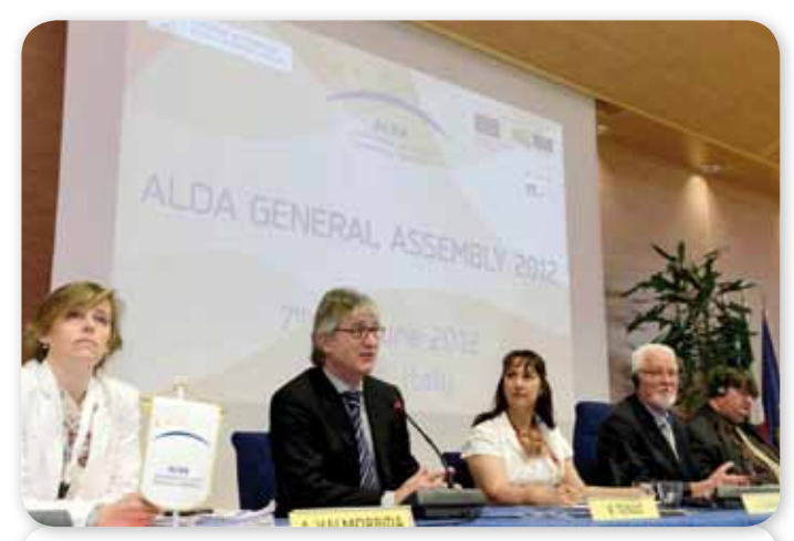
ALDA General Assembly 2012, with Mr. Renzo Tondo, President Region Friuli Venezia Giulia

The 2012 General Assembly and International conference "Strengthening the role of citizens and local governance in the neighbouring Countries: lessons learned and opportunities from East to South".