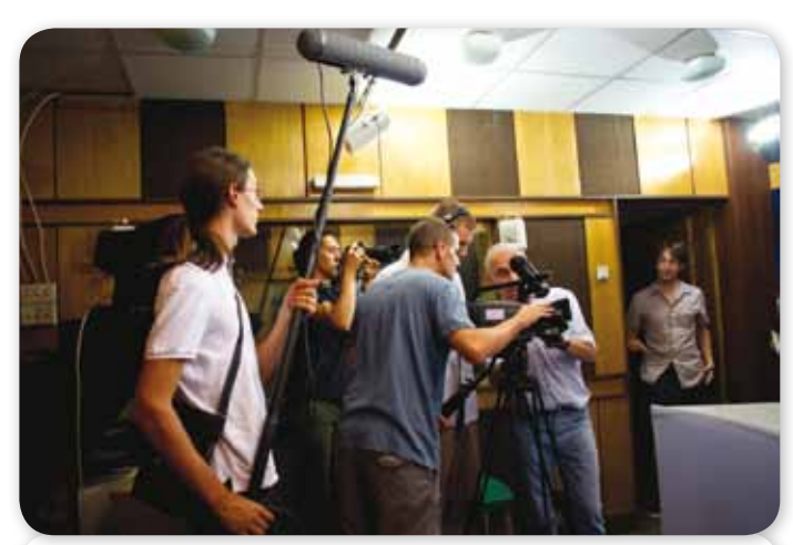
Tour in the Balkans

bloody interethnic conflicts, and are now energetically building their integration to the European Union. Back in their home countries, participants will act as "ambassadors" and transfer their newly acquired experience to fellow students and citizens at the local level. Ultimately, the project also aimed to help these young journalists jumpstart their careers through internships in partner media organisations.