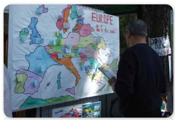
LDA SUBOTICA Day of Europe - EU Info Point

Establishing new contacts between local authorities in Croatia and Serbia, with the possibility of creating a joint project proposal in the framework of the Europe for Citizens Programme. Opening of Resource centres in Subotica and Osijek for networking and town twinning.