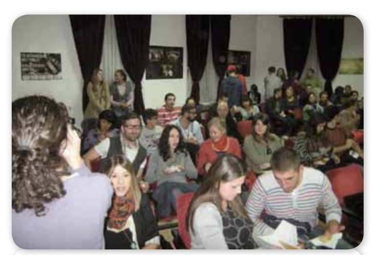
LDA CSS, Citizenship + Open workshop in Nis

Good cooperation between public institutions (schools, library etc.) and local CSO were established. All CSOs supported by Tavolo con Balcani took active participation and gave valuable contribution to different local, national and regional professional networks. All activities in 2012 attracted a large number of volunteers who gave their contribution to the success of all the aforementioned programmes. We consider all this as our success stories in 2012. Finally, we think that the fact that our work is well embedded in local community is of huge importance. This deep connection with territory we work on certainly amplified results achieved i in 2012.