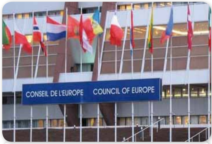
Council of Europe, Strasbourg

The project "Network for Community Development with Marginalised Social Groups", part of the LIFELONG LEARNING PROGRAMME - GRUNDTVIG – Learning Partnership , aims to facilitate the mutual learning of innovative tools of community development that tackle the problems of marginalized social groups in different regions of Europe. The main aim of the project will be sharing knowledge and experiences of the partner organisations gained from experimental, innovative, interdisciplinary community based methods effective in combating poverty that can be adopted in other