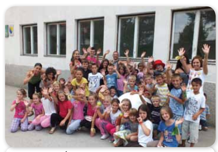
LDA ZAVIDOVIĆI, activities with schools

Association Donne – Donne in nero Progetto, Italy