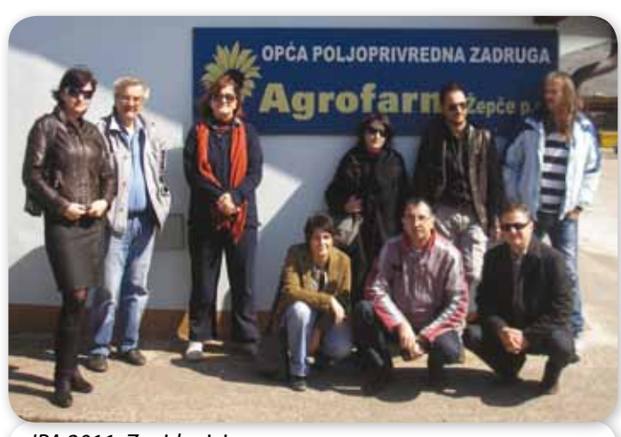
IPA 2011, Zavidovici

The project was implemented in close collaboration with LDA Zavidovici and was intended to help provide clear and factual information on EU enlargement and pre-accession assistance to the citizens in local communities in Bosnia and Herzegovina – Zavidovici, Zepce, Zenica. The project activities were designed to support common understanding of reform process, but also help improve the visibility of specific pres-accession assistance. Further to this, through engaging diverse sections of local society, the action helped raise awareness of what the integration would really mean for BH, while the debates involving local stakeholders will made the prospect of enlargement more credible. Over the last year two training seminars were held for