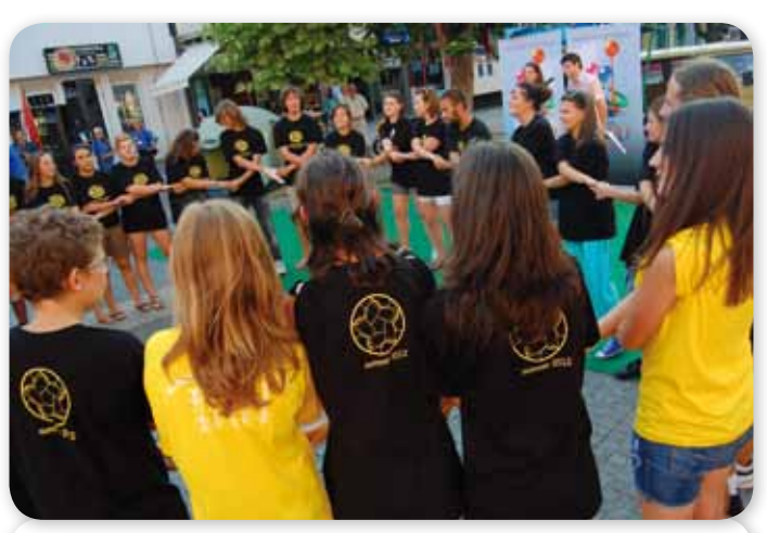
I DA PRUFDOR Youth fair 2012