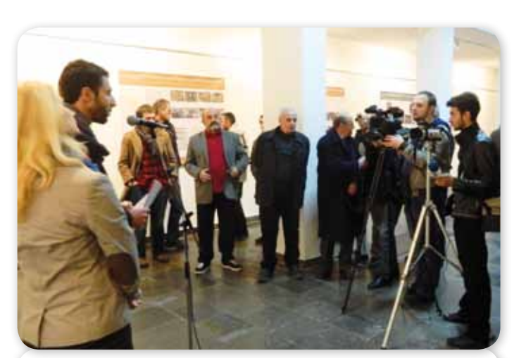
LDA KOSOVO Exhibition in Peja

The important part of the project was mobilisation of all actors on the phenomena of school dropout, this is not anymore a hidden phenomena but open is talked about it and the interest of all representatives of NGOs of Peja/Pec is high in making pressure to the Directorate of Education to face more with this phenomena and through the last phases of the project there is a big hope that will be produced a good and practice Action Plane to deal with the phenomena of school dropout in Municipality of Peja/Pec.