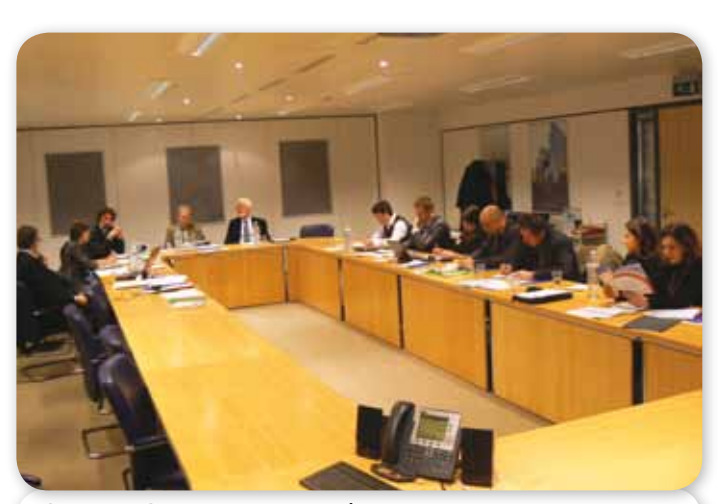
Steering Committee, Brussels