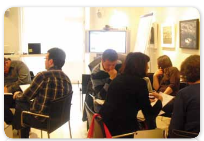
TIC TAC Training session, Brussels, March 2012

exchange of good practices among partners and debating about the main challenges faced by local and European stakeholders in the field of democracy and citizen participation.