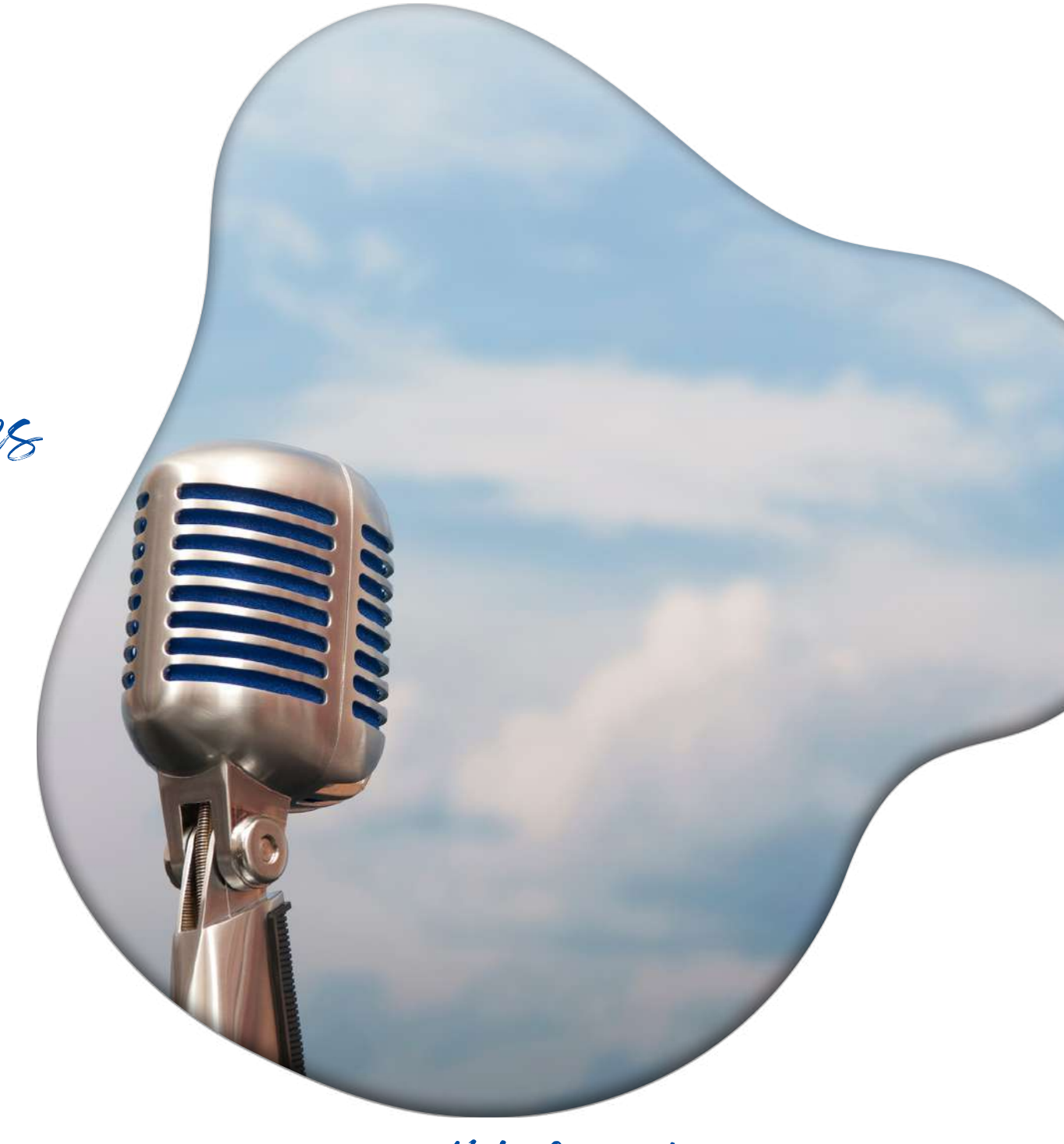
Hub Connection Environment and Climate

The project aim was to improve educational instruments related to environmental sustainability thanks to digital instruments, like a special microphone created to listen to the sounds of the soil, through the radio earphones connected to it. In details, they created new panels and buy two new monitors with their stand—alone supports. They added some advertising materials, as dedicated roll—up to be put in front of the museum. After that, they assembled and installed the new creations at the Verona Natural History Museum managing guided tours and activities whit minors. The promotion was done at the conference "Wildlife and biodiversity" hosting expert speakers on the topic.