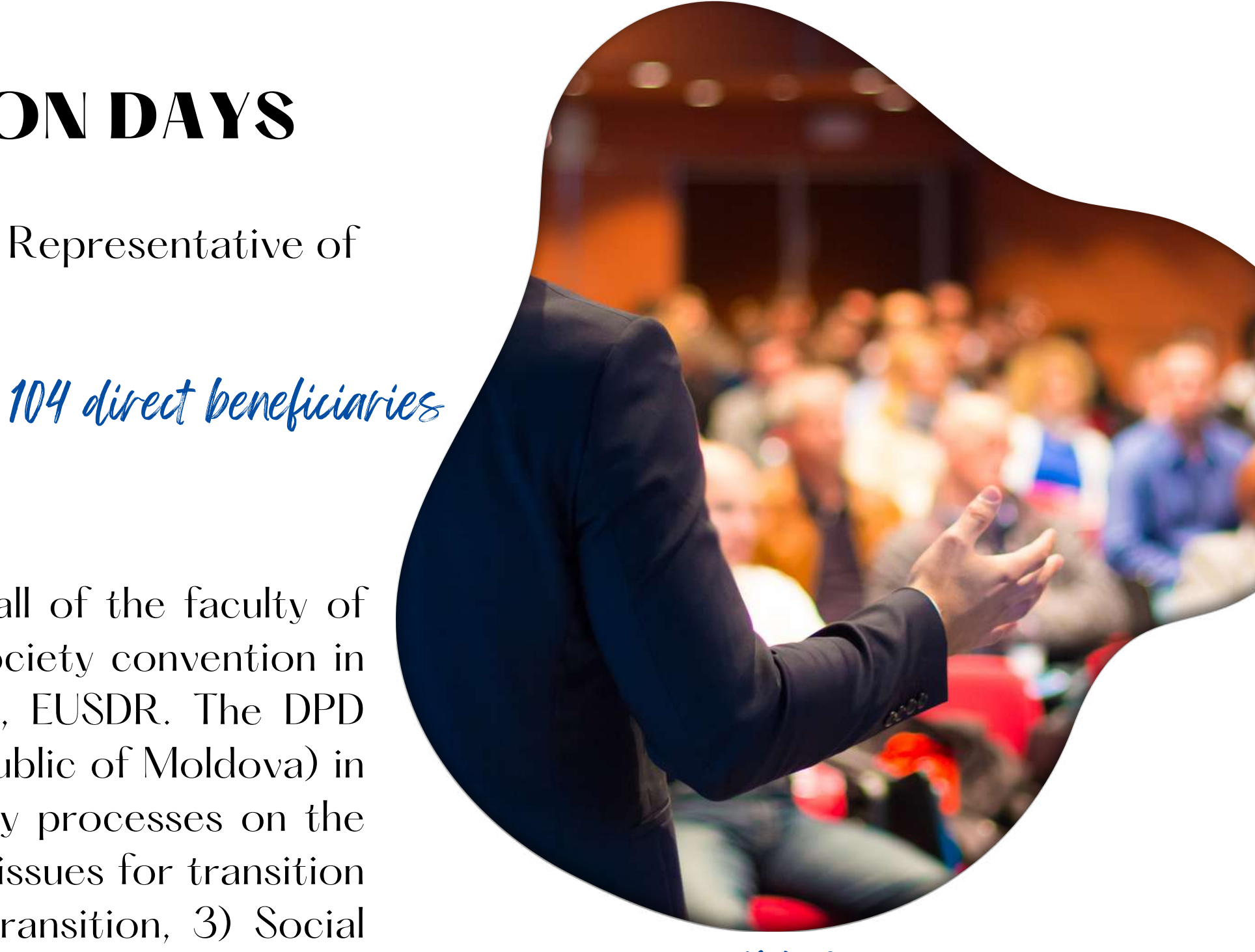
Hub Connection Civic Engagement

The 10 Danube Participation Day, DPD, held at the great hall of the faculty of Social Science of the University of Ljubljana was the Civil Society convention in the framework of the EU Strategy for the Danube Region, EUSDR. The DPD addressed the topic of how to support Ukraine (and the Republic of Moldova) in the framework of the EUSDR in their transition and recovery processes on the path to EU membership. The 10th DPD addressed three main issues for transition and recovery: 1) Democratic Transition, 2) Environmental Transition, 3) Social Transition. These topcis have been addressed by expert panels and related working group sessions formulating three main messages each.