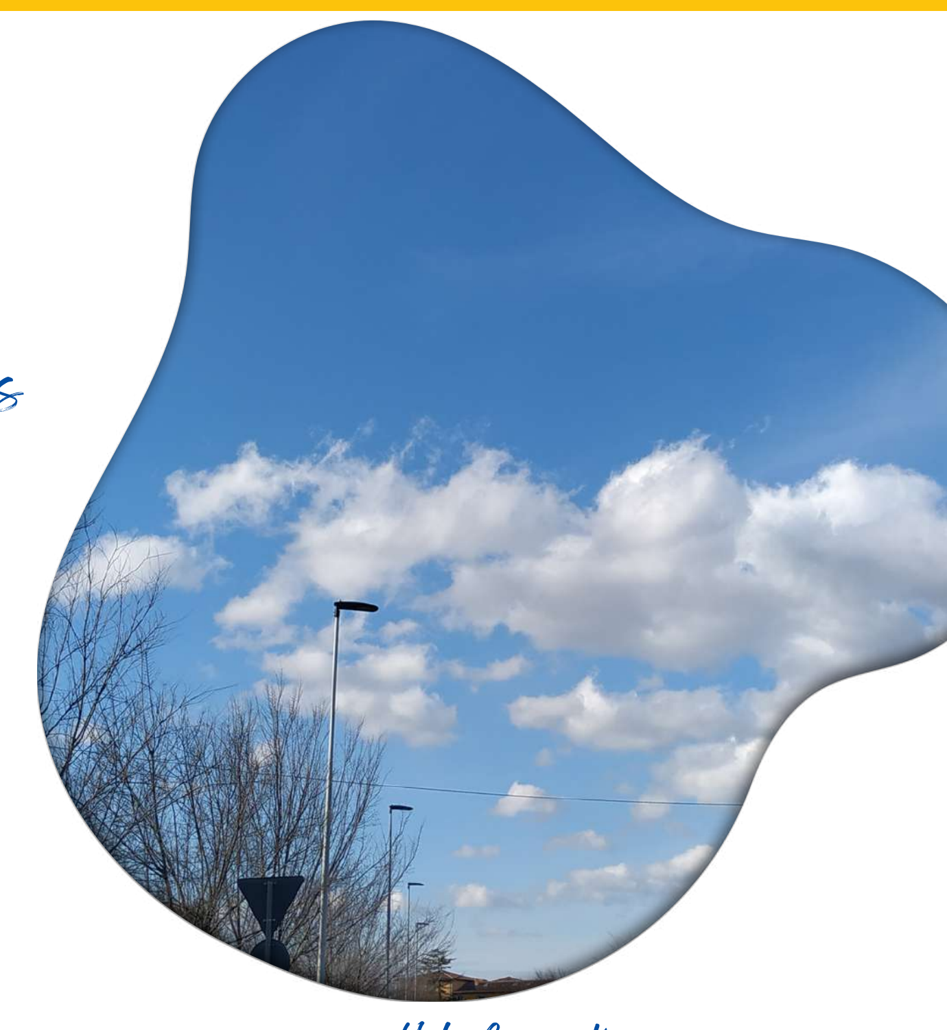
Hub Connection Environment and Climate

The project's goal was to rise awareness about the existing connection with the beneficiaries on 3 territories: Bassano del Grappa, Calvene and Padova. The idea to spread activities on different territories is to connect different actors that work and act on same topics but in different places in order to share not only project implementation but also and mainly to share difficulties and resources. The whole hub had the chance to see difference activities that allowed different actors to dream about different interventions in each territories.