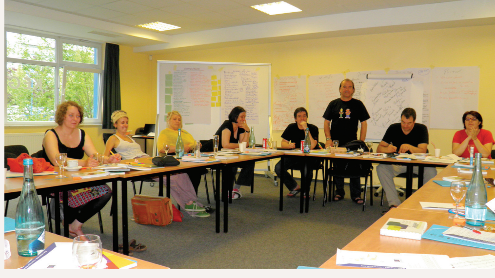
Local cooperation and intercultural training, Neuruppin, Germany

Micro-credits offered by LDA in Osijek and provided through the Council of Europe Development Bank and Ministry of Foreign Affairs of Norway supported development of small and medium enterpreneurs. Within the two-year period, 119 application for different credits were received out of which 29 were applicants launching their business. The balance between sectors was also interesting: 36 credit requests were within the area of agriculture, 27 in tourism and services, 28 in production, 15 in services and 5 in trade, while 8 were classified as "other". The overal amount given for the 15 credits of local enterpreneurs in Slavonia and Baranja county was 393.676,65 €