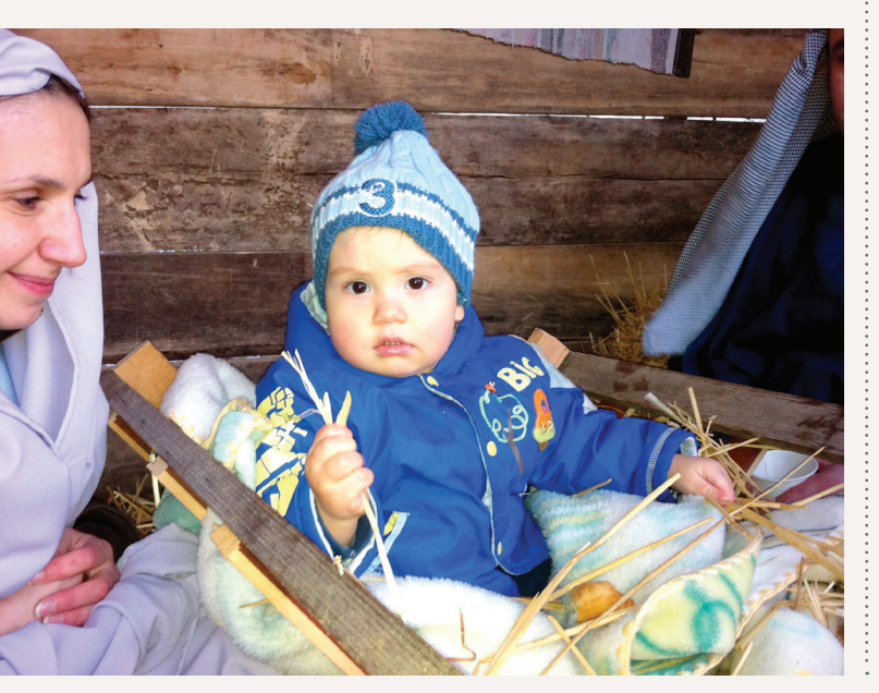
Live Nativity Manifestation 2011 in Aljmaš, Croatia

While measuring the impact of LDA programmes and projects, we took into consideration the the micro, meso and macro levels . We defined the micro level as the impact of LDA activities at the local level having in mind LDA capacities and their local partner network. LDA is a fairly small organization: it has two full-time employees, one outsourced accountant several volunteers, and a network of experts. The experts are local (resources), creative and knowledgeable about their environment. LDA Board members are also local; they are part of the decision-making process and experts within their areas acting as catalysts and participating in LDA key decisions. LDA also has a good network of partner-organizations on local level (within the city of Osijek, on the level of the Osijek-Baranja County and in Croatia, though mostly relying on LDA Sisak and LDA Brtonigla).