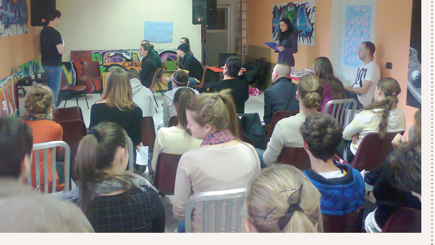
"Back to the Future" - youth exchange, Youth in Action, Italy